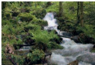
Wildnispfad (t.l.), Luchspfad (b.l.), Impressions of the Black Forest National Park (r.)